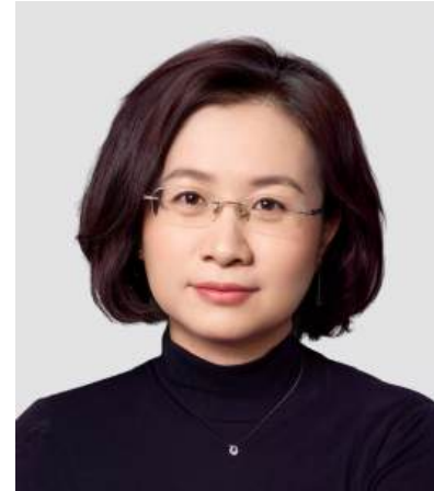
Strategic BD Partner - Germany