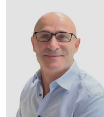
Strategic BD Partner - Italy