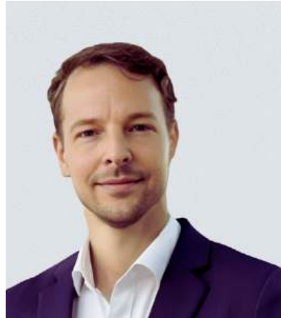
CEO & Co-founder