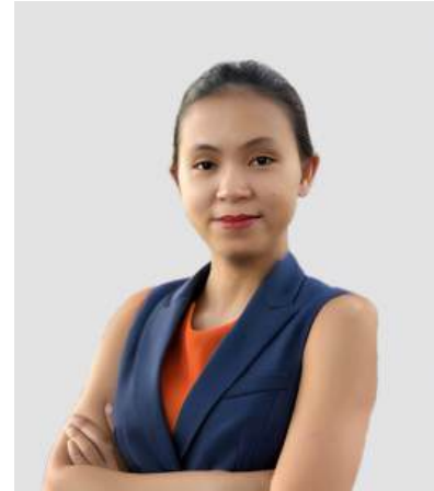
COO & Co-founder