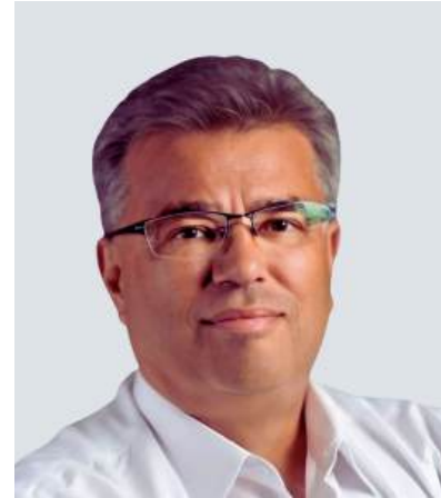
CSO & Co-Founder