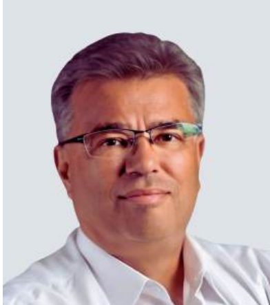
CSO & Co-Founder