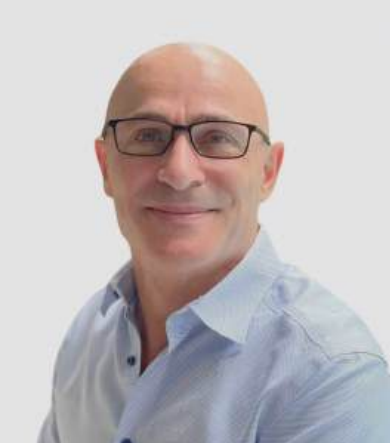
Strategic BD Partner - Italy