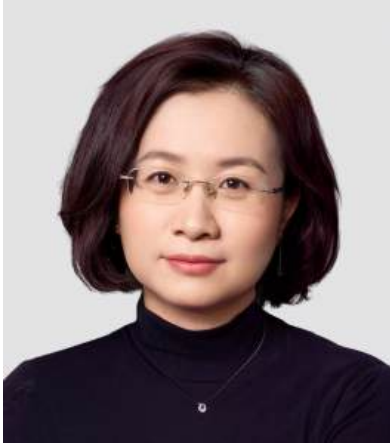
Strategic BD Partner - Germany