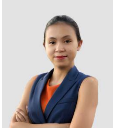
COO & Co-founder