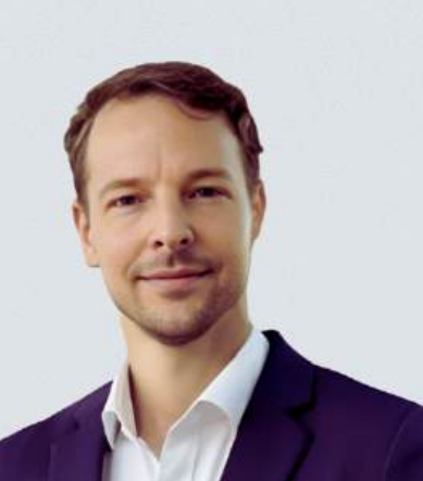
CEO & Co-founder